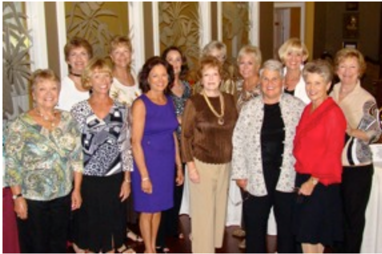
Florida Suncoast Chapter of the Kiwi Club