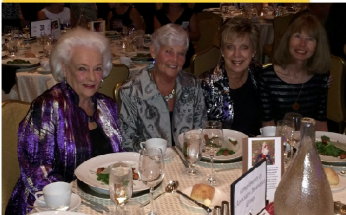
SafeHouse Gala 2015