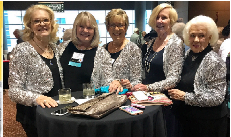
OKC May 2018